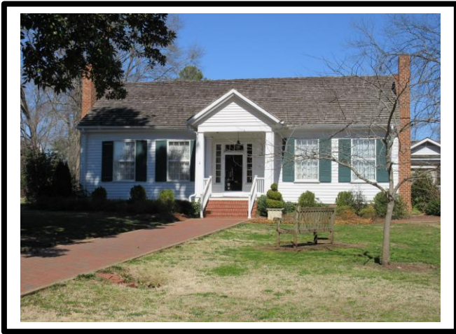
Ivy Green, The Keller Home in Tuscumbia, AL