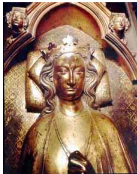
Eleanor of Castile's Tomb at Westminster Abbey

Golden Horseshoe Wreath to be Auctioned At Germanna/Spotswood Reunion