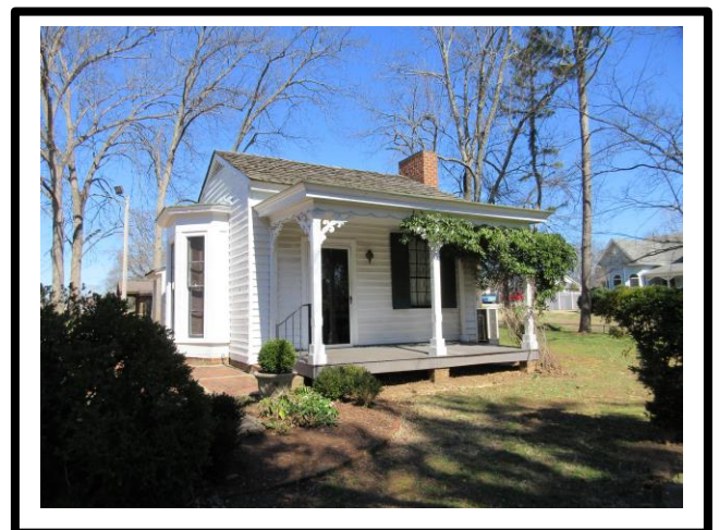
Cottage Where Anne Sullivan Taught Helen to Sign