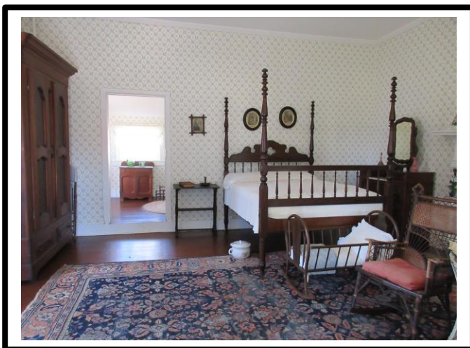
Cottage Bedroom of Helen Keller and Anne Sullivan